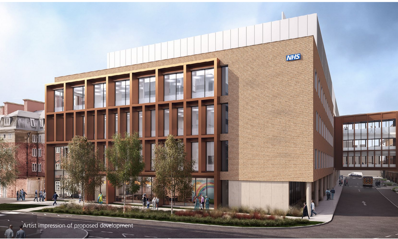
Artist impression of proposed development